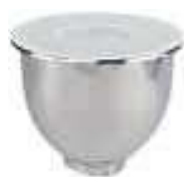
BOWL WITH LID