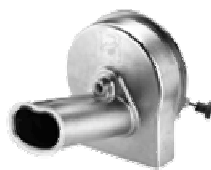
VEG CUTTER & BLADES