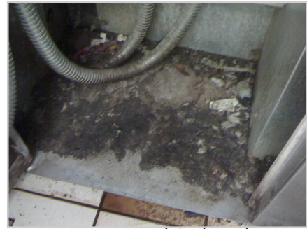
Dirt, Rats, Mice and Cockroaches on the floor of the Rack Oven Control Panel