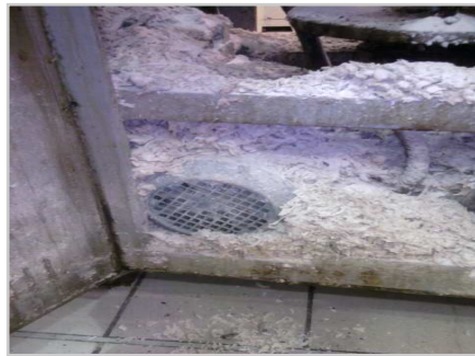
Motor covered with dirt and dust