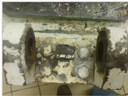
Rust & Dirt Build up on Bun Divider