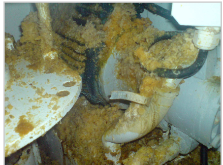
Build-up of oil and flour on motor of bread divider