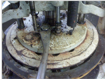
Dirt & Oil build up on the gears of a bun divider