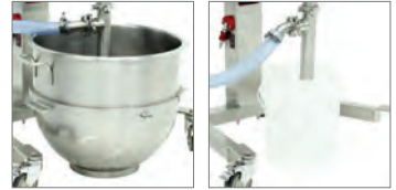
Pump from any bowl or container