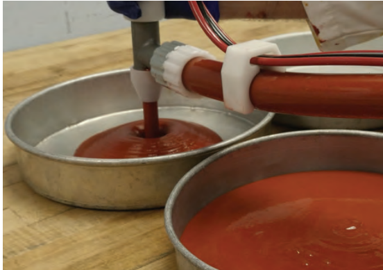
Adjustable deposit speed for different products