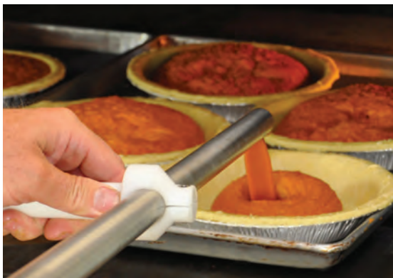
Interchangeable product cylinders with 2" and 3" diameter for dynamic depositing capabilities