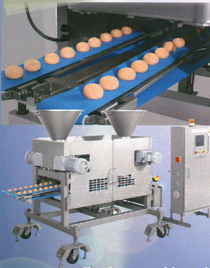
Two Rows Encrusting Model Producing 24,000 pcs / hour