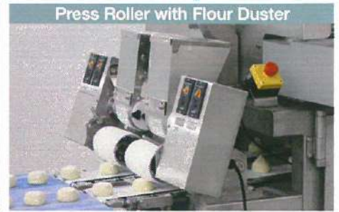
Press Roller with Flour Duster

The Secondary forming option on the forming conveyor shapes the products consistently.