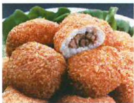
Meat filled Croquette