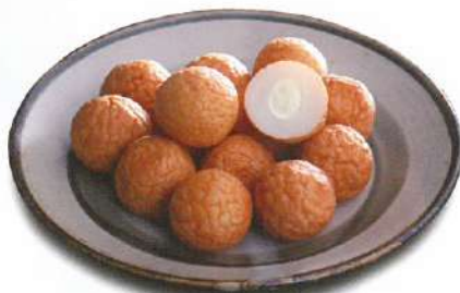
Boiled fish Paste Mayonnaise