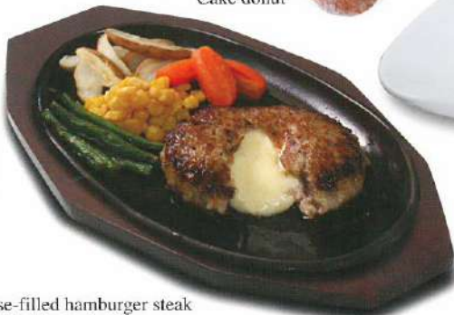
Cheese-filled hamburger steak (with additional forming device)