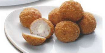
Cheese-filled chicken balls