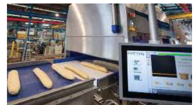
Grafic User Interface: Argodisplay