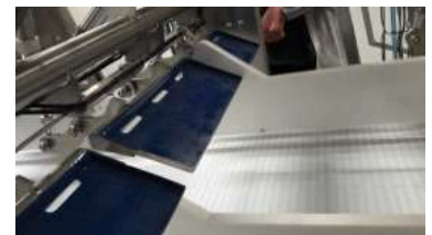
Multi-door batching system