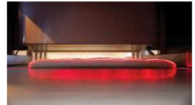
3D laser scan